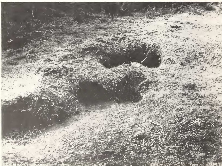
Fig. 2. Otter holt on Rona on the top of a small peninsula, with defaecation points (↑)